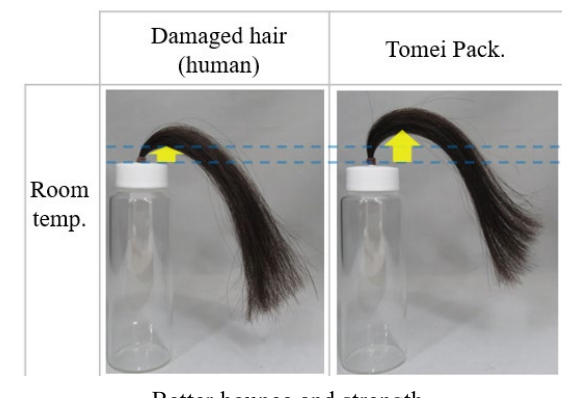
Better bounce and strength