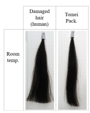
Less frizz caused by dryness and damage